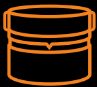
Super Slow Rotating Camera Stand