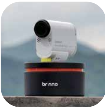
ART200 with Action Camera

Rotates 360° as slow as in almost 25 days