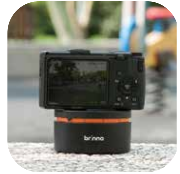
ART200 with Digital Camera

Brinno Pan Lapse is a simple rotating stand with Bluetooth Low Energy (BLE) remotely controlled, lets you take beautiful panning Time Lapse Video with your camera or smartphone.