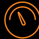
Adjustable Rotation Speed