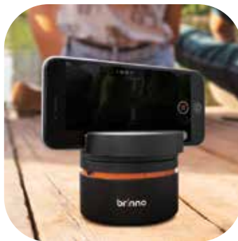
ART200 with Smartphone