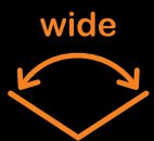
Adjustable Sweeping Angle